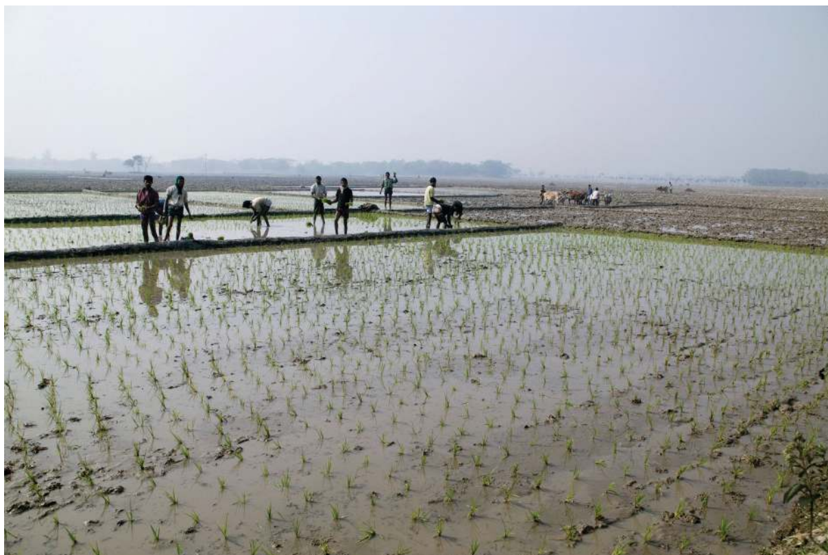
Photograph A for Question 3(a)

This document consists of 1 printed page and 1 blank page.